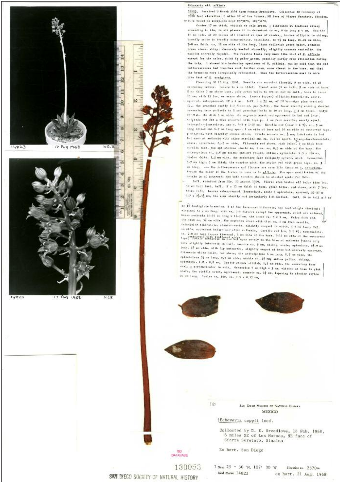
Figure 6. Image of the holotype of the name Echeveria coppii .