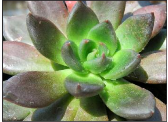
Figure 4. Echeveria affinis is a rosetate species with dark green to black leaves.

Description: Caudex 17mm thick, whitish or pale green, ± flattened at leaf base sites (in old plants decumbent to ca. 6dm long × 4cm). Rosette to 12cm wide, consisting of 20–24 ascending leaves, all crowded at apex of caudex. Leaves elliptic-lanceolate to oblong, broadly acute to broadly subacuminate, apiculate, to 5.5cm long, 20–24mm wide, 7–8mm thick, ca. 12mm wide at the base, light yellowish green below, reddish brown above, shiny, obscurely keeled dorsally, slightly concave ventrally, the margins narrowly rounded. Floral stem 32cm tall including inflorescence, ca. 9mm thick (wide) at base, 5mm thick at 3cm above base, pale green below to bright red in inflorescence, bare in lower 13cm, with 11 leaves or scars higher up (below inflorescence). Bracts (12–)22–25mm long,