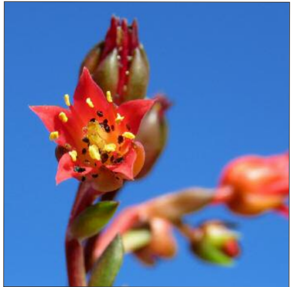
Figure 5. Close-up of the bright, crimson red flowers of Echeveria affinis .

(4–)5–7mm wide, 2.5–3.5mm thick, elliptic-lanceolate, subadpressed, acute and apiculate, spurred, the spurs shortly and irregularly 1–2-toothed. Inflorescence 6–16 × 3.5–8.0cm, 16–30 branches plus terminal flower, the branches 1–2(–3) flowered, the lower clearly showing aborted remnants; true pedicels to 5mm long and pseudopedicels to 10mm long, ± 1mm thick; lower pedicels 10–15 × 1.5–2mm, upper pedicels 5 × 1mm. Calyx reddish to dark red, disk 3.0–3.5mm wide, the segments erect and adpressed in bud and late anthesis but for a time upcurved with tips ca. 1mm from corolla, nearly equal to slightly unequal in width, (4–)5–8 × 1.0–1.5mm mm long, (1–)2–3mm wide, triangular-lanceolate, acute. Corolla red, 6–8(–9)mm long when closed, 6–7mm long when open,