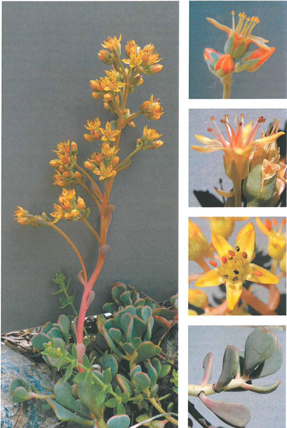
FIG. 2. Sedum kiersteadiae . Note widely spreading yellow petals often marked with red on the dorsal surface, and the open spacing of leaves on the sterile shoot.