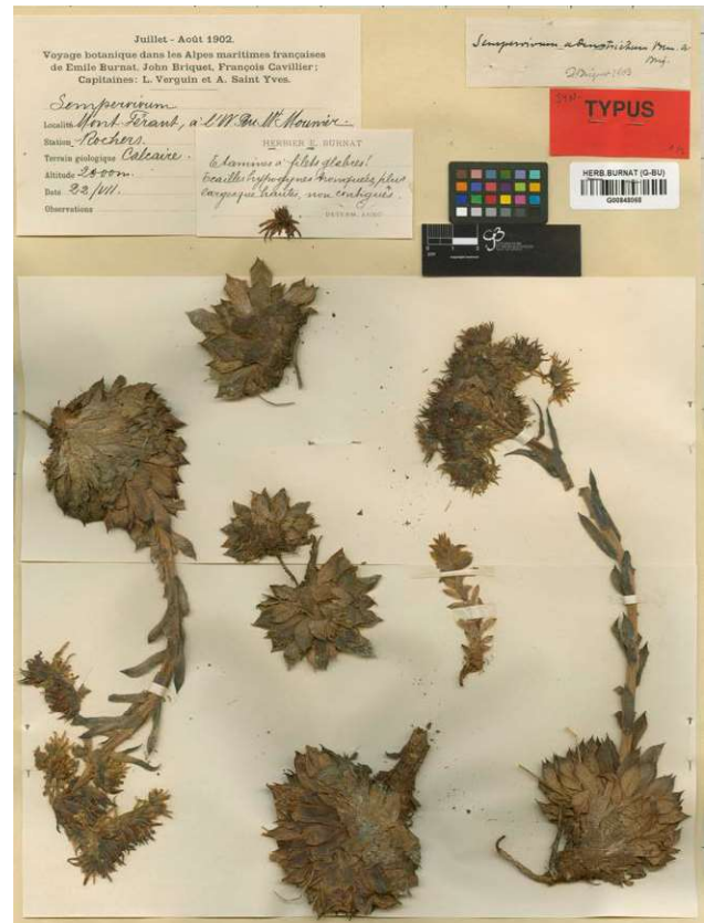
Figure 2. Lectotype of Sempervivum adenotrichum Burnat (G00848068, G-BU.

Rosettes leaves erect or suberect, 30-100 (150) mm diameter. Leaves glandular on both faces, ciliate at the margins with glandular cilia (1 mm long); green or somewhat glaucous, (8)-10-(15) mm broad and (25)-30-(50) long, linear or obovate with brown or violet apex. No smell of resin. Inflorescences strong, (12)-20-(30) cm long, glandular; compact not scorpioid. Flowers rounded in the bud and densely glandular. Petals (11)-12-(15), linear, reflexed toward the apex (decumbent) or twisted with a hooked tip, light or dark pink, with a green central line and violet spots of varying size; (10-) 12-14 (-15) x (1-) 1,5-2,5 (-4) mm. Carpels erect, green, glandular at least on the ventral side, but often throughout with