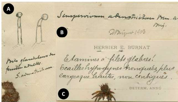
Figure 1. Details of the labels of the syntypes of Sempervivum adenotrichum Burnat. A. Drawing of E. Burnat, showing the glandular cilia on the leaf margins (G00848069). B. Label written by J. Briquet (Lectotype, G00848068). C. Label with morphological notes (Lectotype, G00848068).

ers. 15 Juillet 1949 ». Laurence (Herb. H. Laurence, P00321304, P [digital image at http://mediaphoto.mnhn.fr/media/1441344133347hfUgodcx0ryISleF ]). Neotype here designated.