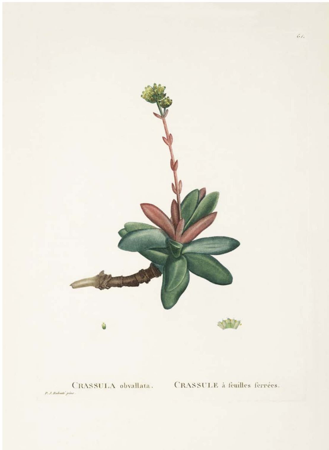
Fig. 3 Redouté plate of Crassula obvallata from De Candolle, Plantarum historia succulentarum 2(11): t.21. 1801

Roy Mottram, Whitestone Gardens, Sutton, Thirsk, North Yorkshire YO7 2PZ England, U.K.