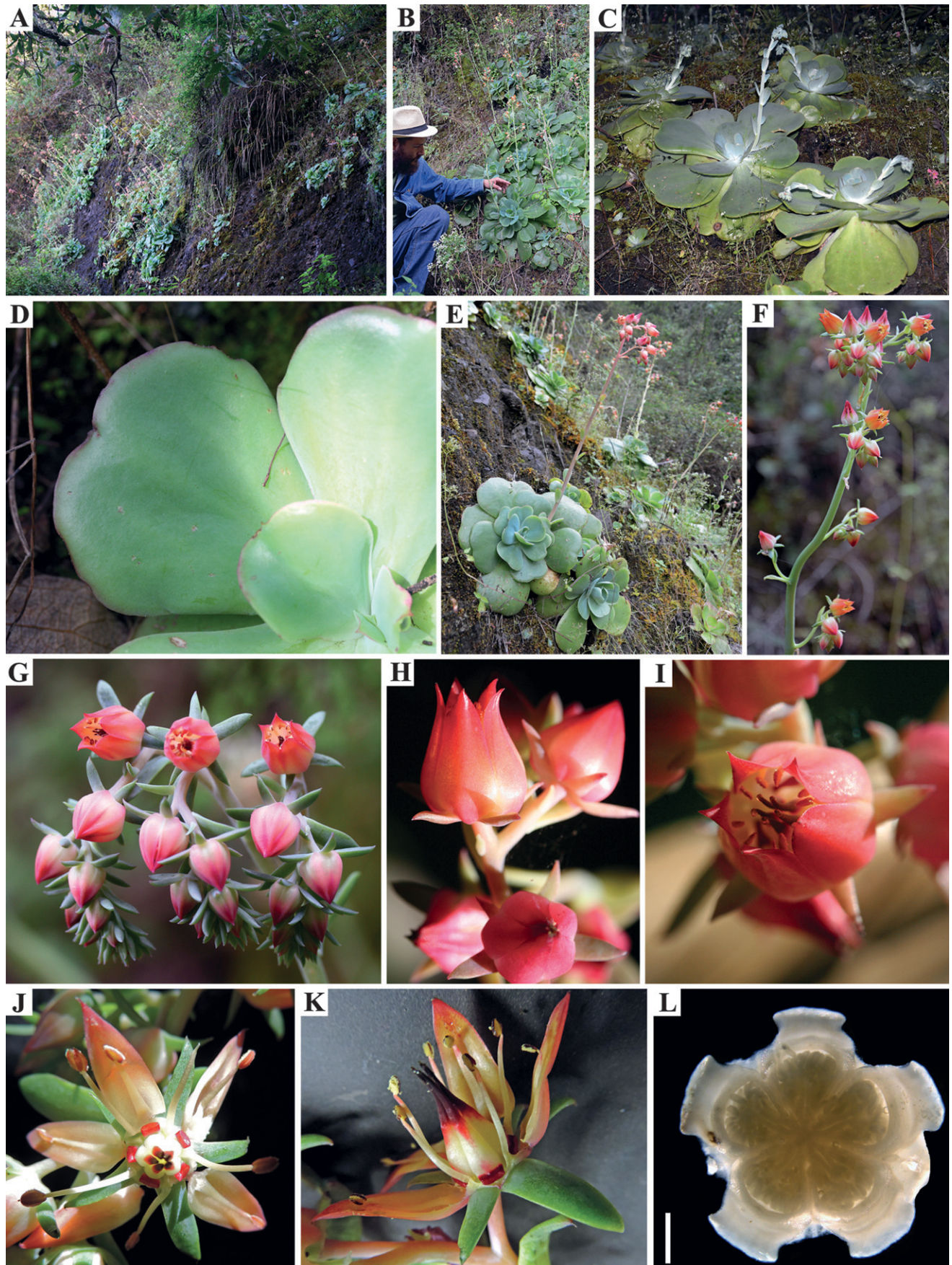
FIG. 1 Echeveria pistioides . A–B. Habitat. C. Leaf rosettes and developing inflorescences. D. Leaves. E. Habit. F–G. Inflorescence. H–I. Flower viewed from different positions. J–K. Flower opened to show stamens and nectaries. L. Cross-section through FAA fixed ovary, revealing nectaries; white color is due to pigment extraction by the ethanol. Scale bar = 1 mm.